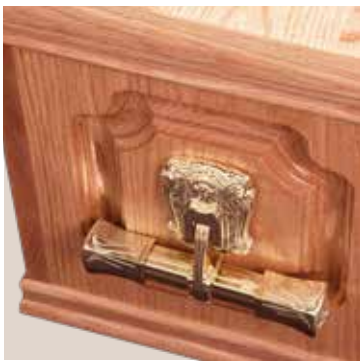
Butt joint ends