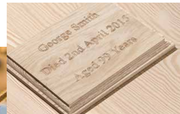
Engraved wood mount available on all wooden coffins