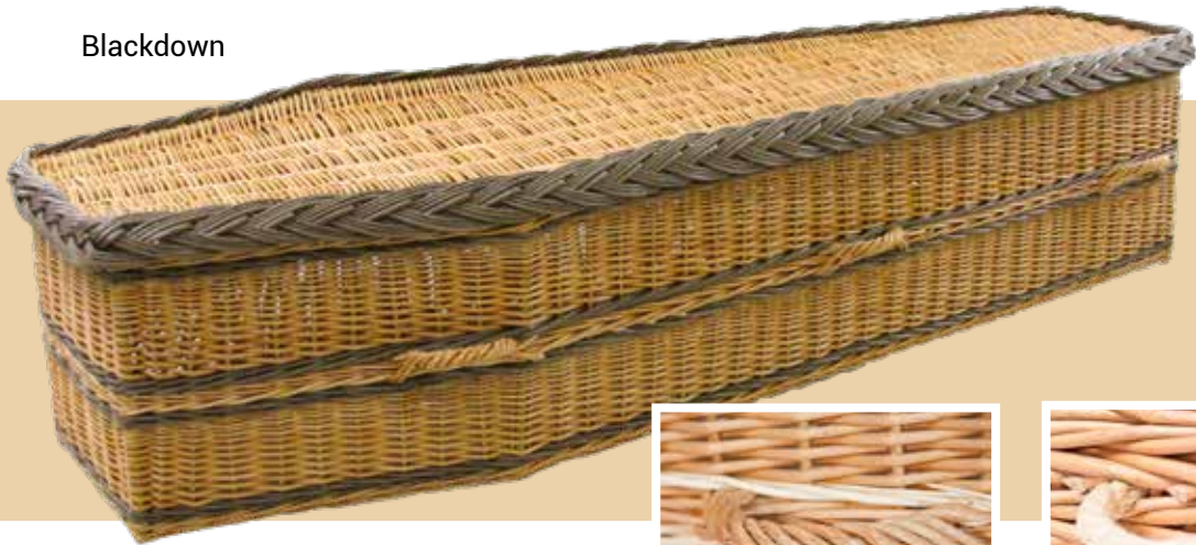
Handle Options -