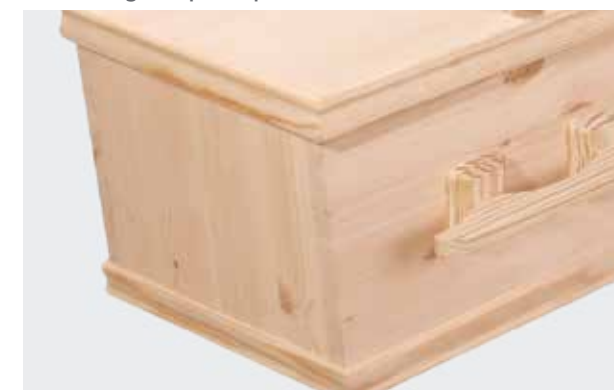
Crafted butt joint ends