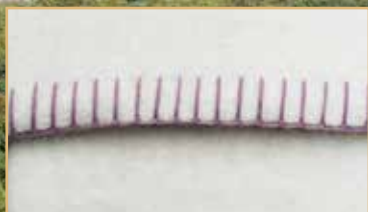
Heather stitch (optional)