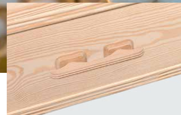
Matching bespoke pine handles