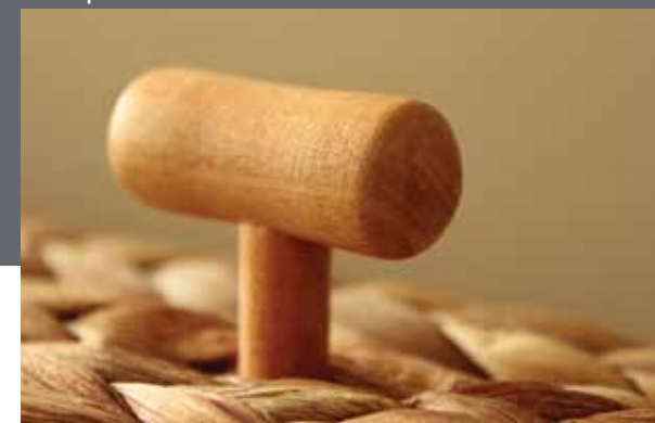
Hand carved wooden screw pegs