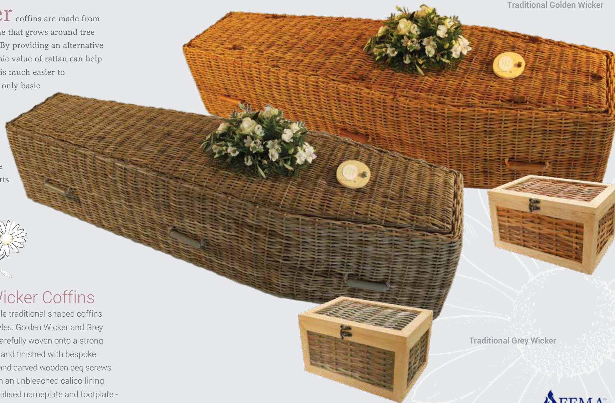
Traditional Grey Wicker