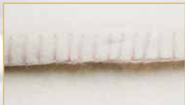
Natural stitch (standard)