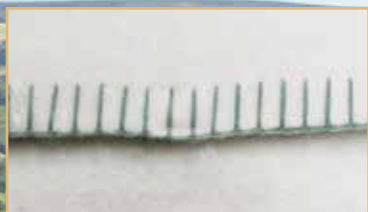
Sage stitch (optional)